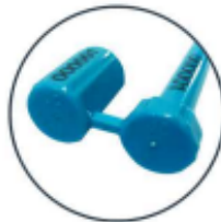
Joined Shaft and Pin