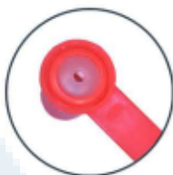
One Way Locking