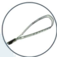
Narrow Metal Strap