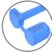
Joined Shaft and Pin