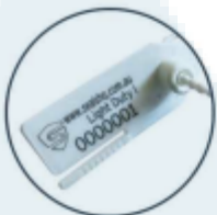
Tear Off Feature