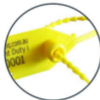
Gapless Entry / Exit