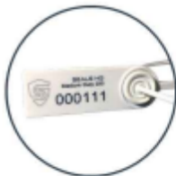
Large Marking Flap